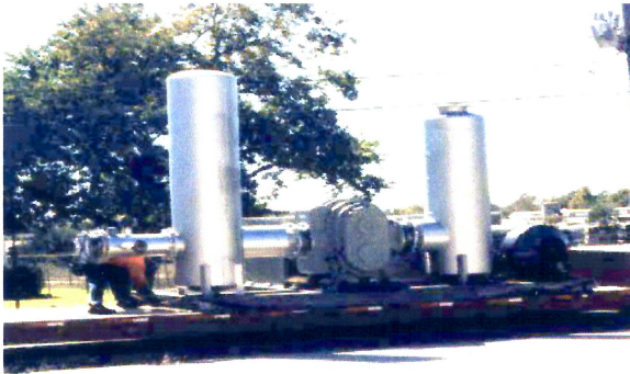
500 HP ROOTS Blower Package for the Petrochemical Industry

CALL CDC FOR QUALITY BLOWER PACKAGES & PNEUMATIC CONVEYING