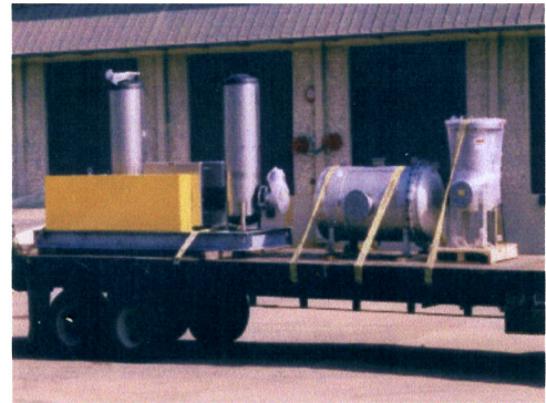
(Above) Blower & Accessory Items (Below) Blowers Ready to Ship