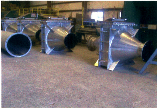
CDC COOLER Packages for the Petrochemical Industry